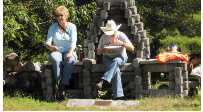
Fall Ride, September 19, 2010