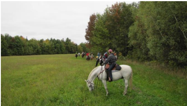
Albion/China ride, September 26, 2010