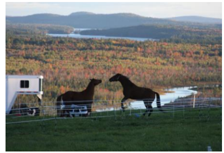
Mt Vernon, October 9, 2010