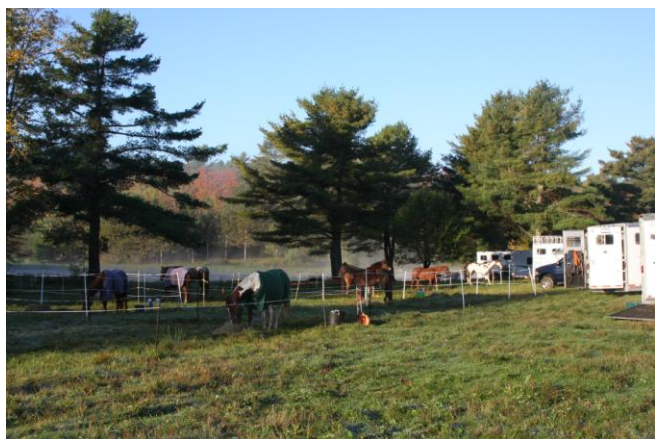
West Gardiner morning, October 3, 2010