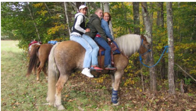
October 3, 2010

Due to the cancellation of the fall Horse Show, some of you have been left short on volunteer hours. I would like to meet with you as a group at 7:00 before the November meeting. The reason behind this meeting is to discuss ideas for the volunteer work so those of you who are short can get the hours you need for year end. See you at 7.