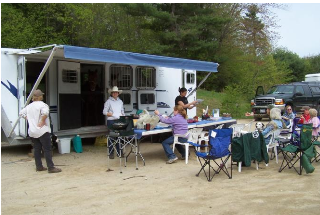
Pampered Chef fundraising, Turner, May 16, 2009