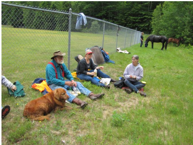
June 13, 2010