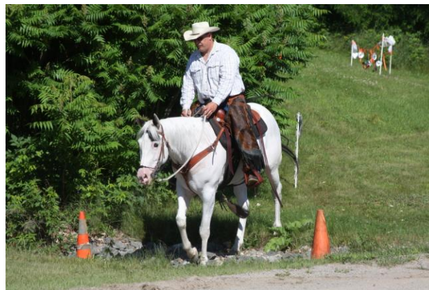
“Stream crossing” at the Trail Trials event.