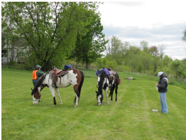
Lunch in Corinna, May 9, 2010